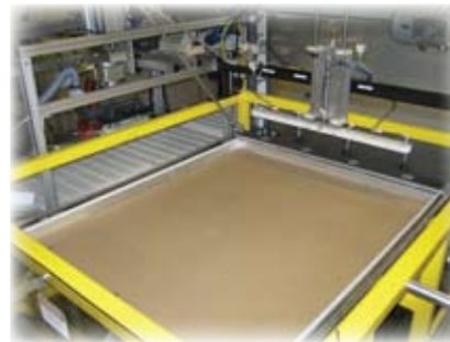
Portable Tier Sheet Dispenser