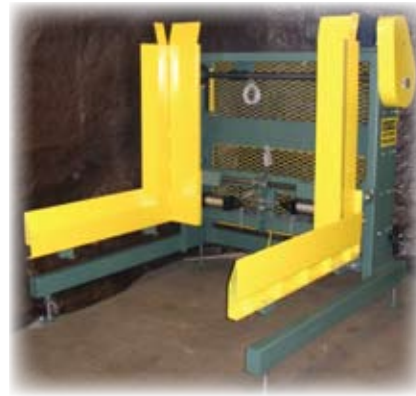
Optional Pallet Dispenser