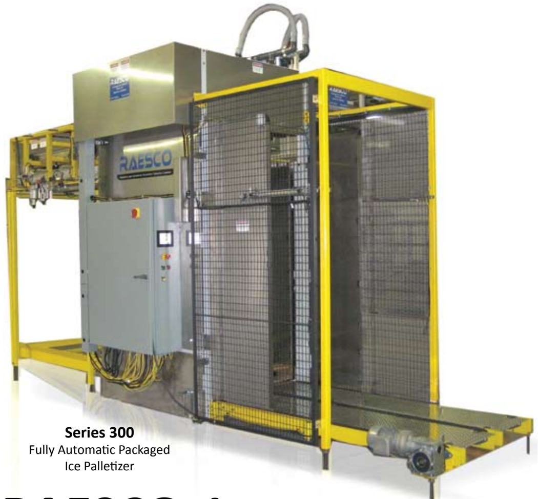
Series 300 Fully Automatic Packaged Ice Palletizer